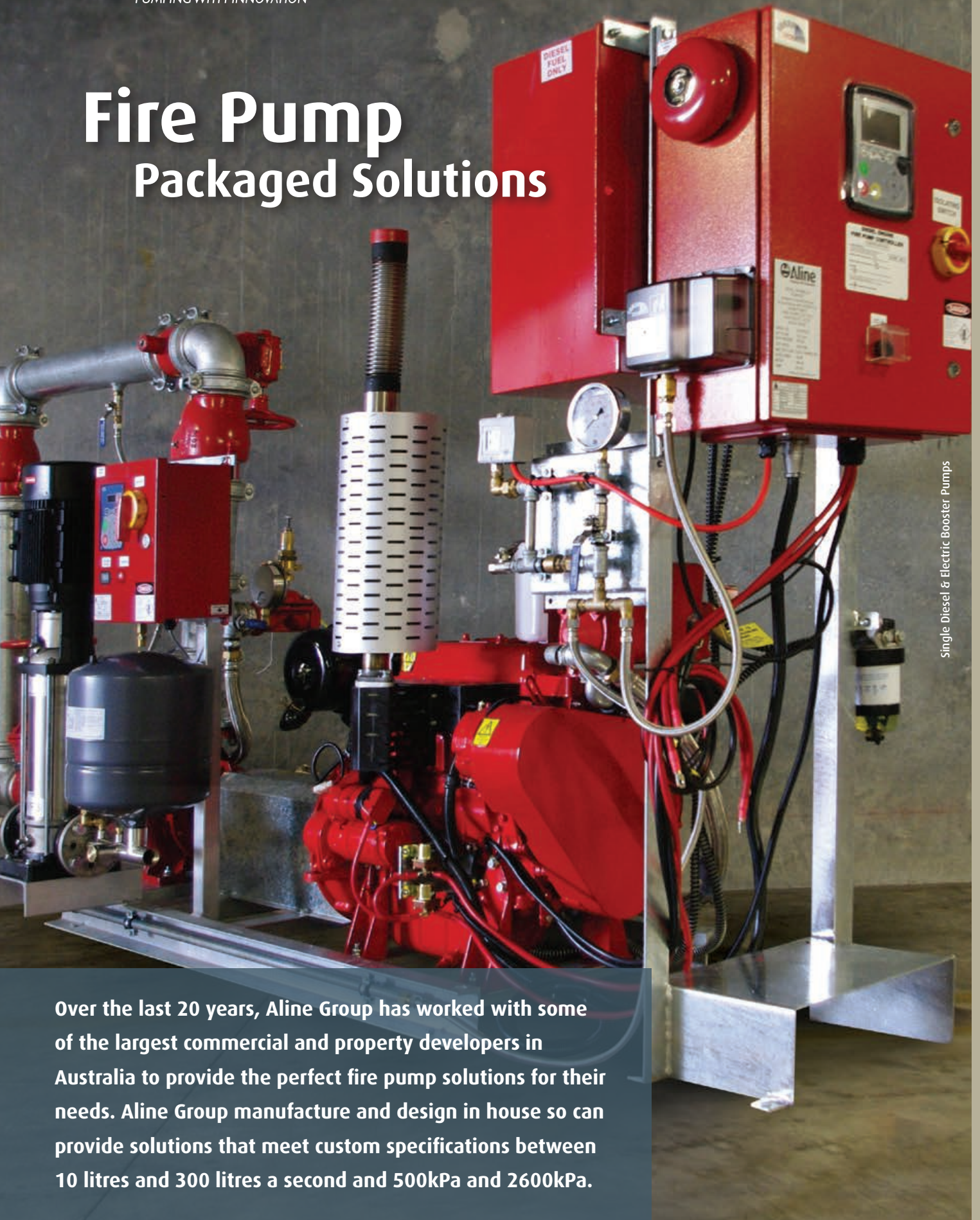
Single Diesel & Electric Booster Pumps

Over the last 20 years, Aline Group has worked with some of the largest commercial and property developers in Australia to provide the perfect fire pump solutions for their needs. Aline Group manufacture and design in house so can provide solutions that meet custom specifications between 10 litres and 300 litres a second and 500kPa and 2600kPa.