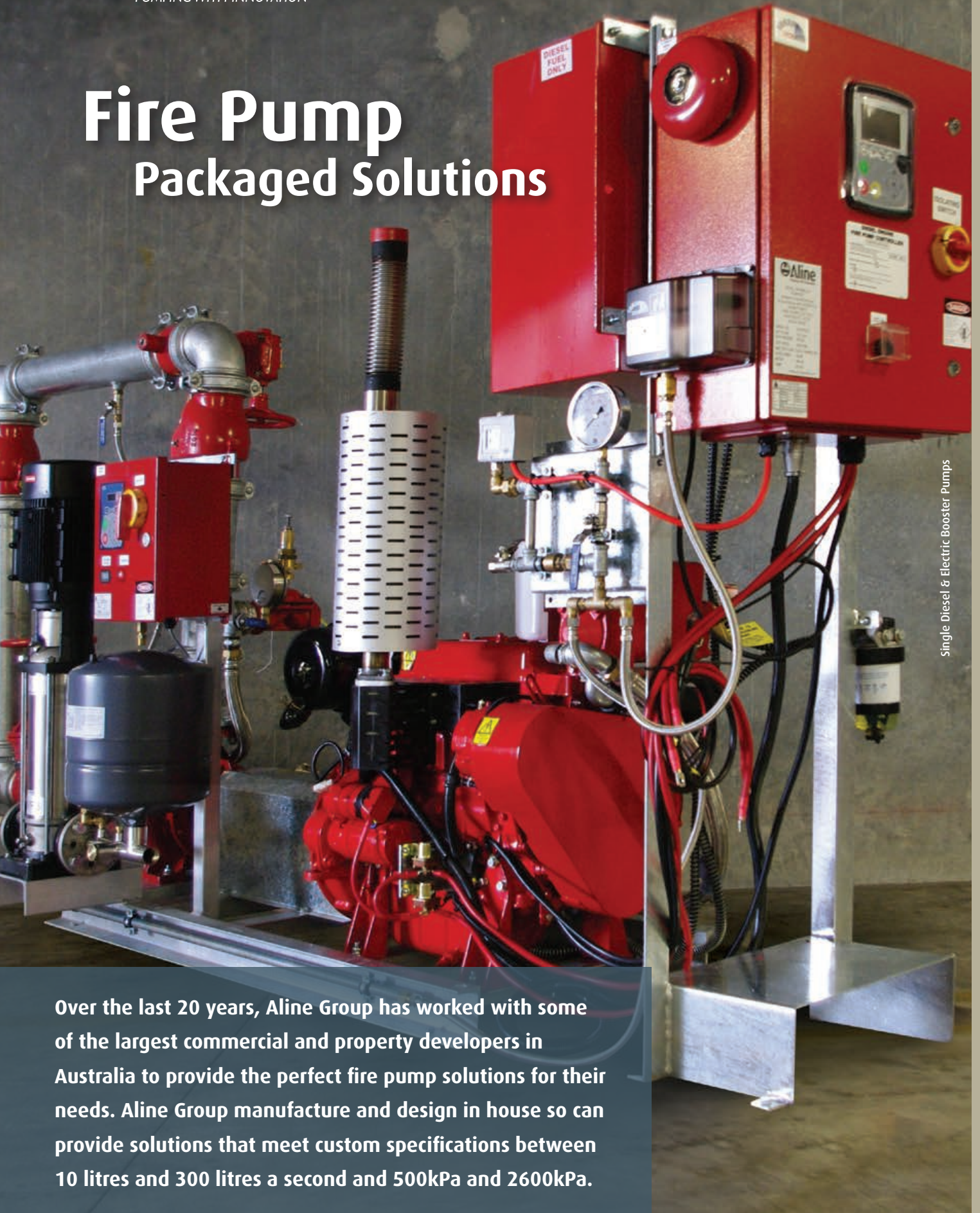
Single Diesel & Electric Booster Pumps

Over the last 20 years, Aline Group has worked with some of the largest commercial and property developers in Australia to provide the perfect fire pump solutions for their needs. Aline Group manufacture and design in house so can provide solutions that meet custom specifications between 10 litres and 300 litres a second and 500kPa and 2600kPa.